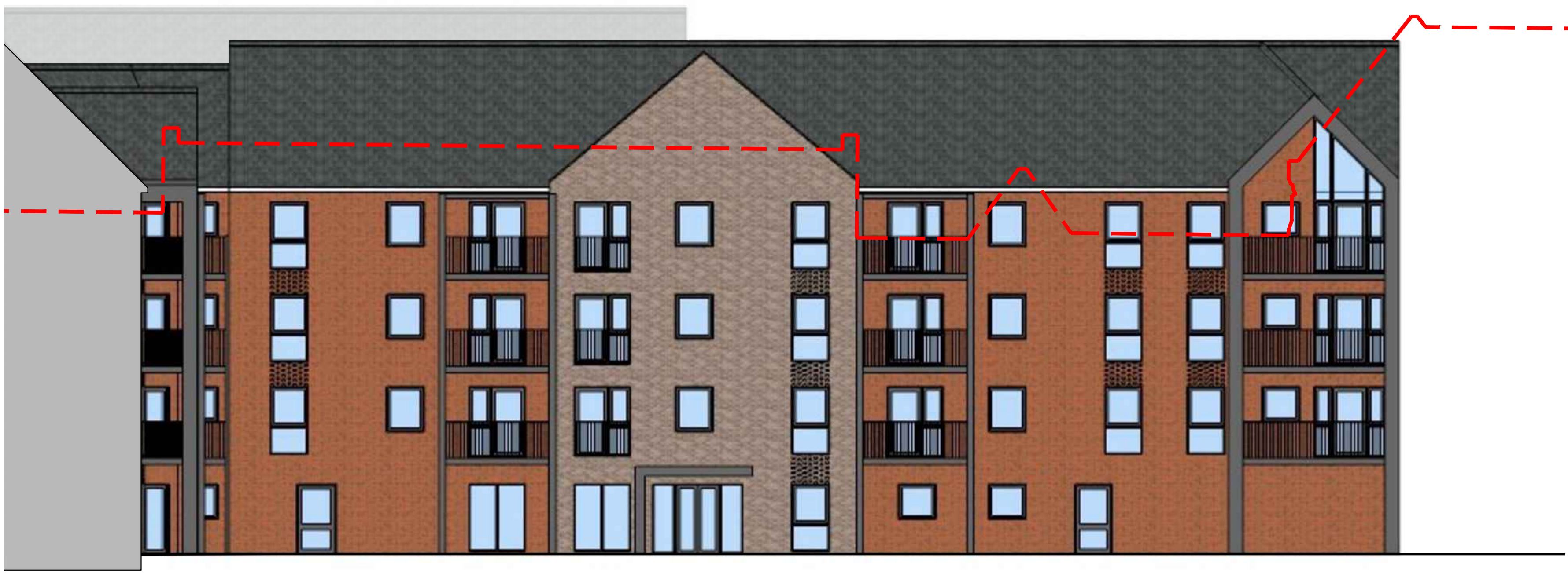
BLOCK B - NORTH ELEVATION (WEST WING)