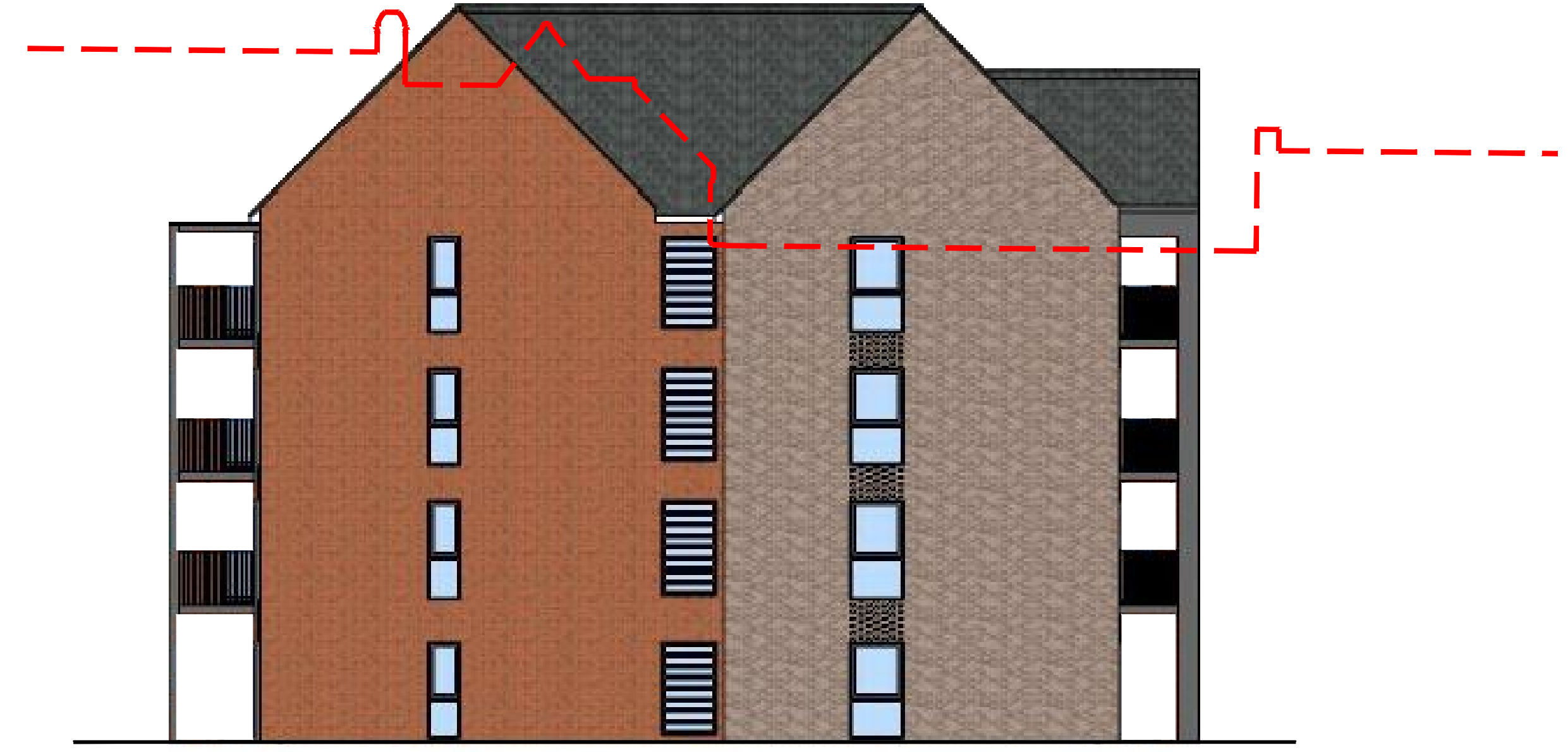
BLOCK B - NORTH ELEVATION (NORTH WING)